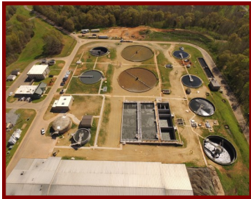
Aerial View of the First Broad River WWTP

The sewer collection system consists of gravity sewer lines, lift stations, and force mains that convey wastewater to the First Broad River WWTP. The City owns and maintains 213 miles of gravity sewer and force main lines with 19 lift stations. The City of Shelby also maintains five (5) lift stations for Fallston and three (3) for Kingstown.