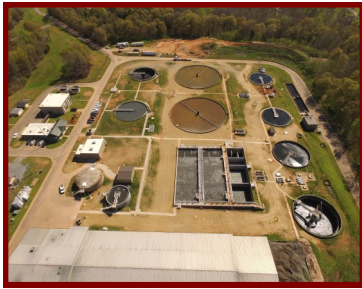
Aerial View of the First Broad River WWTP

The sewer collection system consists of gravity sewer lines, lift stations, and force mains that convey wastewater to the First Broad River WWTP. The City owns and maintains 213.34 miles of gravity sewer and force main lines with 20 lift stations. The City of Shelby also maintains five (5) lift stations for Fallston and three (3) for Kingstown.