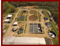
Aerial View of the First Broad River WWTP

As part of a commitment to support educational awareness and promote better learning, Shelby offers tours of the wastewater treatment plant to various interest groups. For a tour of the plant, contact the Wastewater Plant Supervisor at 704-484-6850.