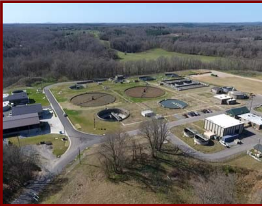
Aerial View of the First Broad River WWTP

The sewer collection system consists of gravity sewer lines, lift stations, and force mains that convey wastewater to the First Broad River WWTP. The City owns and maintains 219.8 miles of gravity sewer and force main lines with twenty (20) lift stations. The City of Shelby also maintains the sewer collection systems for the Town of Fallston and the Town of Kingstown.