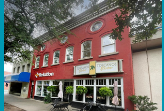
Original City Hall & Fire Dept. - Then & Now

Explore beautiful architecture and scenery on this self-guided roundtrip walking tour of Shelby's Historic District. From the breathtaking design of the Banker's House (photo at right), to Shelby's first post office and current location of the Cleveland County Arts Council (see below), you will enjoy this walk along Shelby's historic streets, and learn about some of our oldest, and most iconic landmarks along the way.