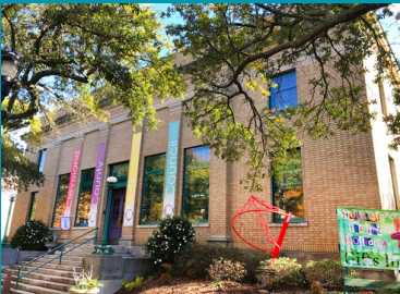
Cleveland County Arts Council

Click here for Google Maps walking directions to easily navigate the route. This self-guided walking tour is round trip and will take approximately an hour to an hour and a half to complete.