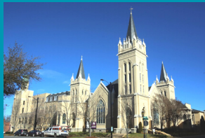
First Baptist Church

A listing of the 14 stops along the route with photos and information about each stop can be accessed by clicking here .