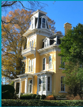
The Banker's House

Explore beautiful architecture and scenery on this self-guided roundtrip walking tour of Shelby's Historic District. From the breathtaking design of the Banker's House (photo at right), to Shelby's first post office and current location of the Cleveland County Arts Council (see below), you will enjoy this walk along Shelby's historic streets, and learn about some of our oldest, and most iconic landmarks along the way.