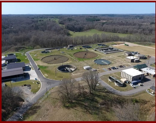
Aerial View of the First Broad River WWTP

The sewer collection system consists of gravity sewer lines, lift stations, and force mains that convey wastewater to the First Broad River WWTP. The City owns and maintains 221.5 miles of gravity sewer and force main lines with twenty (20) lift stations. The City of Shelby also maintains the sewer collection systems for the Town of Fallston and the Town of Kingstown.